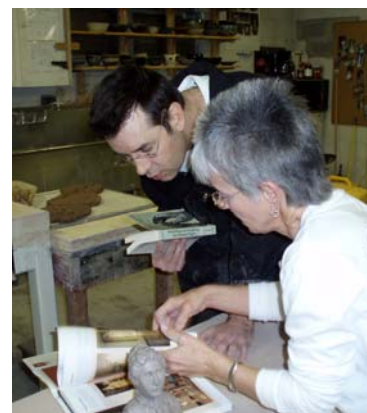
Monday night class

Studio Cook & Clean ~ Sunday, February 18