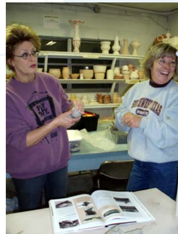
Monday night class