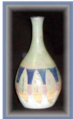
Bottles won at the March Pot Draw