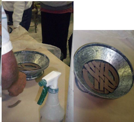
Orbry recommends arranging extruded strips of clay in a diagonal pattern