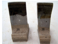
Figure 3A & 3B