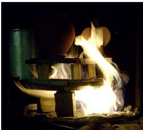
Amy's Demon Fire

Each tile was dipped in a cone 10 clear glaze then dipped halfway into each batch of the test Soto Slip recipe. There didn't seem to be much difference between the two base clays. Wetherby will glaze some more test tiles at a later date using our cone 6 clear glaze to test in the electric kiln.